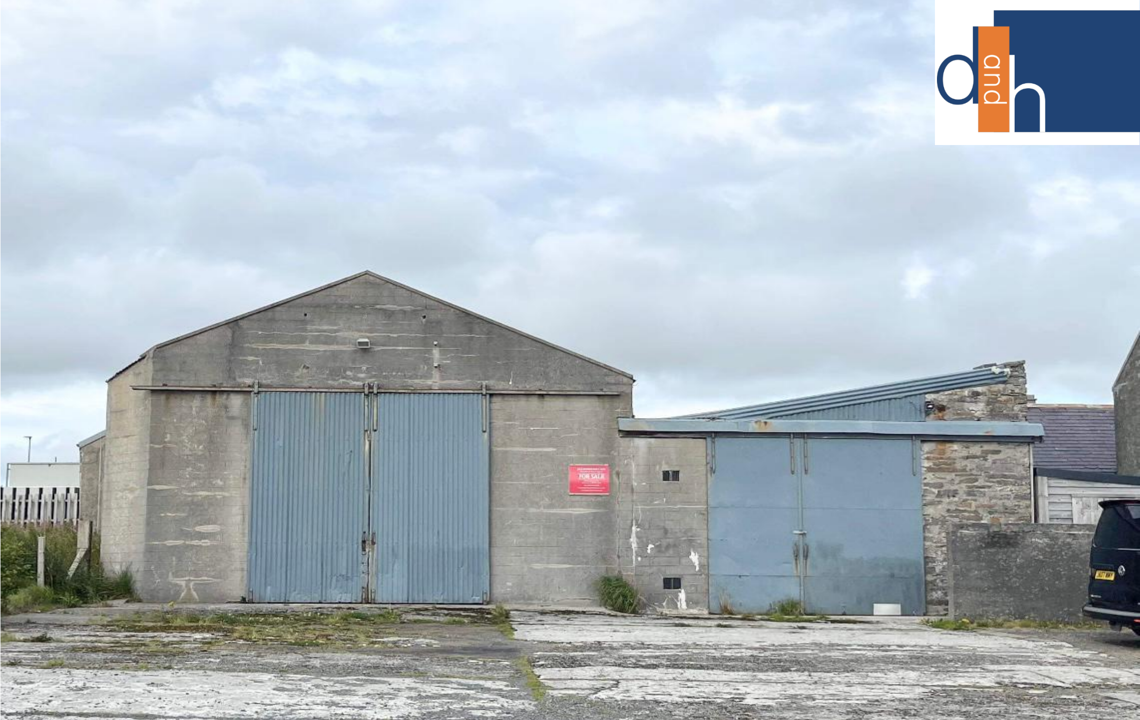
Sheds, Back Road, Dounby, Orkney, KW17 2HT FOR SALE – Offers in the region of £75,000