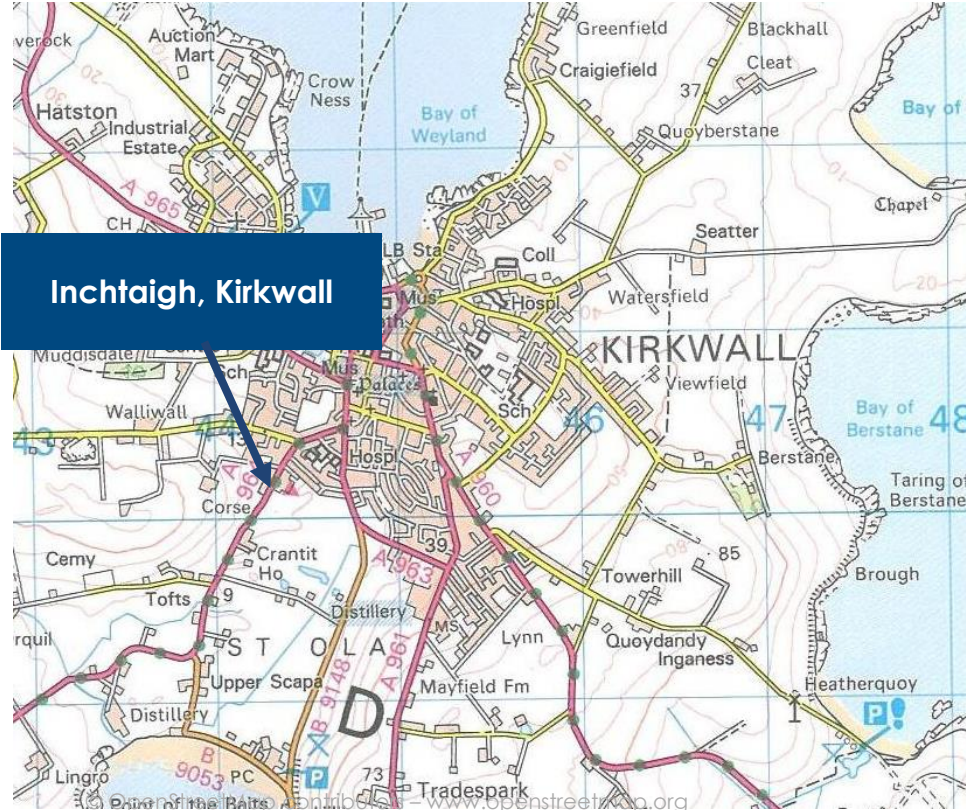
This map is made available under the Open Database Licence

Email: hello@dandhlaw.co.uk *All viewings are conducted at the viewers own risk.